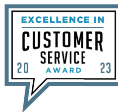
EcoEnergy Insights was named a '2023 Organization of the Year' for delivering excellence in Customer Service

Overall, refrigeration under-cooling instances were reduced, and the trading area occupant comfort compliance was improved. This helped the retailer to improve food safety compliance and also manage sales area and storage area compliance. The retailer also benefited from reduced unoccupied period energy consumption.